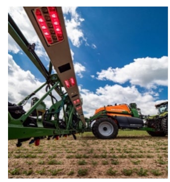
Technologie ONE SMART SPRAY

The experiments were carried out on grain maize crops grown by farmers in Maïsadour. By helping to reduce the environmental footprint while maintaining the profitability of farms, the ONE SMART SPRAY intelligent spraying solution provides a concrete response to the current problems of the agricultural world. An economic model for this solution is being built between the BASF and Maïsadour teams.